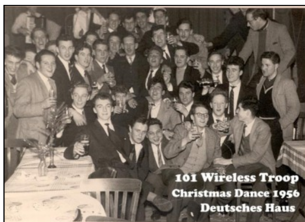
101 Wireless Troop Christmas Dance 1956 Deutsches Haus

“To foster and keep alive the comrade spirit of all those who served at Langeleben.”